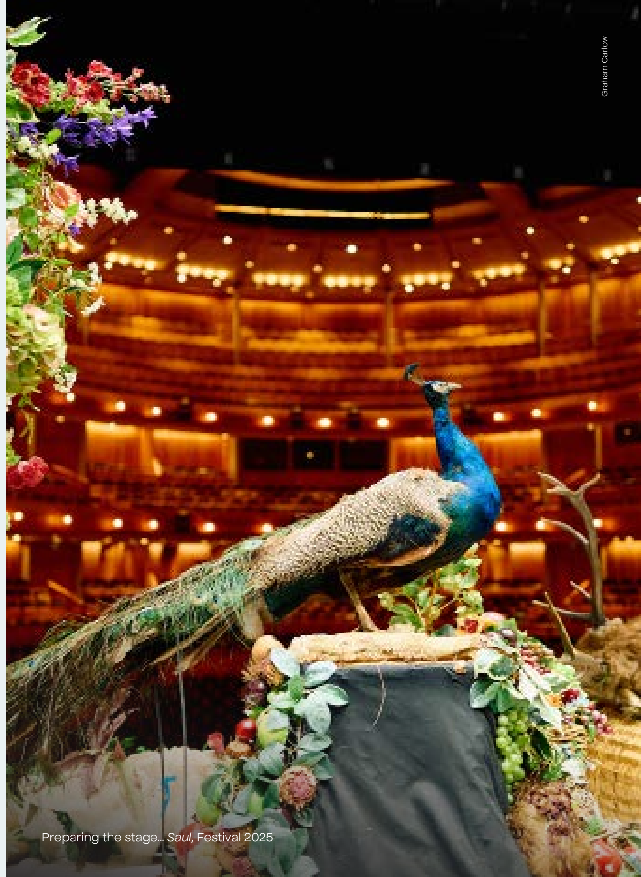
Preparing the stage... Saul , Festival 2025